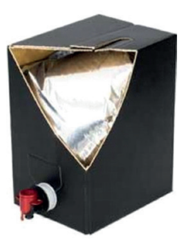
Bag in Box 10kg and 20kg Aseptic bag inside a cardboard boxes