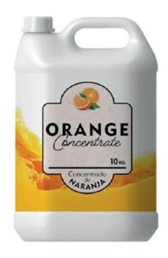
Jerrycan 5kg and 10kg Airtight plastic jerrycans